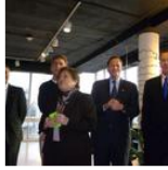
Stamford Dems' Leader Returns to Education