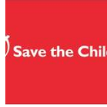
Benefit Save the Children by Shopping