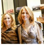
Saks Lights Up the Night for a Good Cause