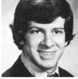
Stamford Foundation Honors Homegrown Leaders